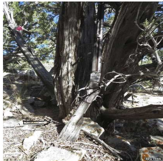
Have you seen this photo of the old rifle found leaning into this tree in the desert southwest? It has been there for many, many years.